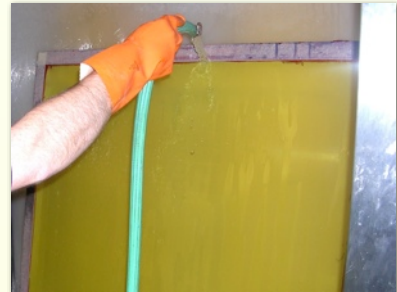
3. Flood rinse the screen starting at the top and washing all residue off the screen.