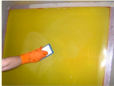
2. Scrub screen with non-abrasive pad or brush. Let dwell 1-2 minutes.